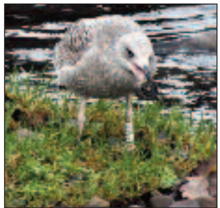
Gull photo by Mark Waldron

I've watched this gull fighting off other juveniles for food or prime feeding spots, it certainly seems healthy. Also it is not easy to approach – it is just as wary as any gull even when you try to entice it with bread!