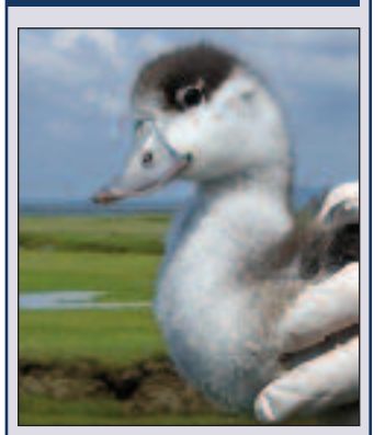
£ 12 buys a bag of specially formulated duck crumbs.

□ Shelducks have been recorded as far back as medieval times and there is fossil evidence of shelducks from 150,000 years ago.