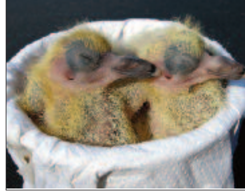
FEEDING TIME Left, one of our mistle thrush fledglings being fed in a rehabilitation aviary. TAKING A BREAK We care for all species including feral pigeons.

UP AND ABOUT This young tawny owl is already able to fly reasonable distances. don't know where they were found – one chick was left in a box on a veterinary