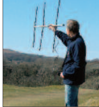
KEEPING TABS Above, radiotracking in action, and left, house martins in one of our aviaries.

However, our results were very encouraging and we have changed protocols in wildlife hospitals across the UK. For example, we released our hand-reared house martins as soon as they fledged from their artificial nests in our aviaries, while other hospitals kept young house martins in aviaries for a couple of weeks after they had fledged.